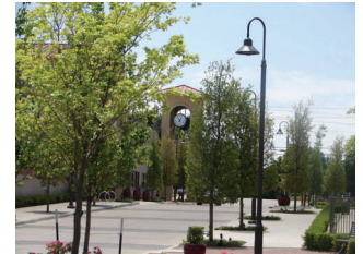
DESOTO CITY CENTER