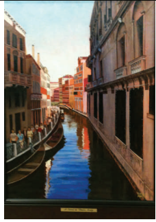
SECOND PLACE Rudy Amato